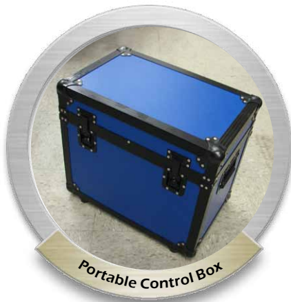
Portable Control Box