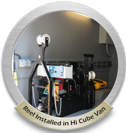
Reel Installed in Hi Cube Van