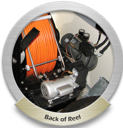
Back of Reel

“Anyone can make a product that is complex, but only Cobra can make one that is simple to use. Cobra has achieved their ‘So Advanced... It’s Simple’ tag line with the video reel and all the equipment they manufacture. There is no better Inspection System.”